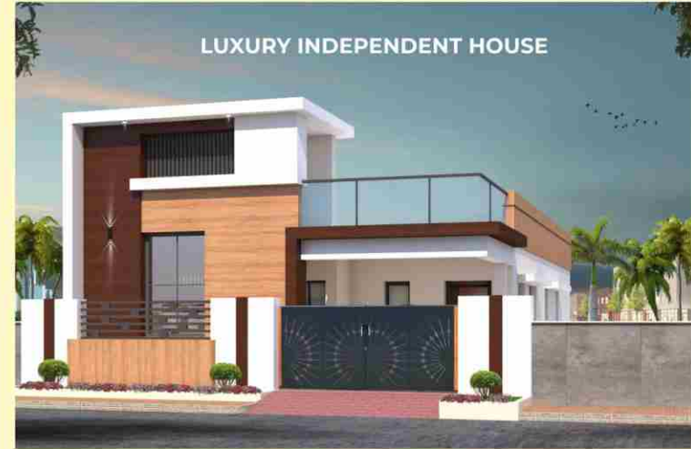
LUXURY INDEPENDENT HOUSE